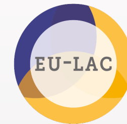
EU-LAC Foundation Fundación EU-LAC